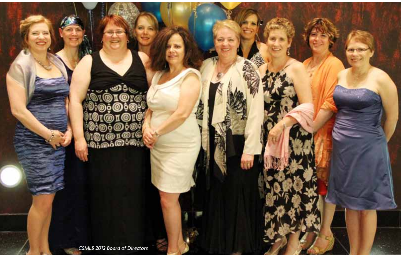
CSMLS 2012 Board of Directors