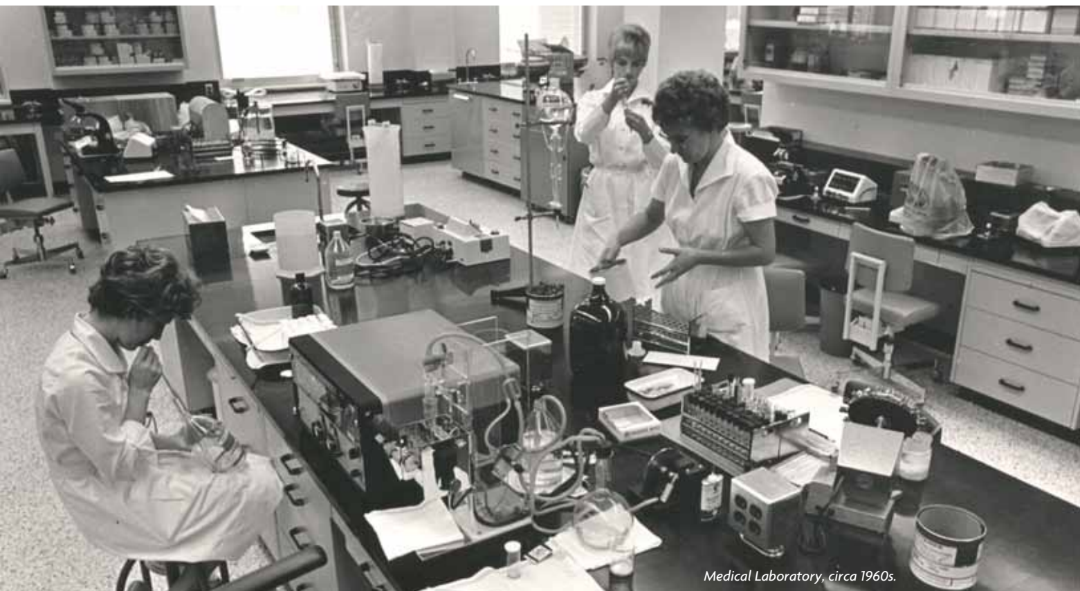
Medical Laboratory, circa 1960s.